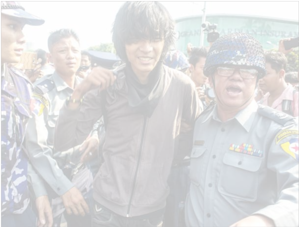
Police release a demonstrator they briefly detained during a protest outside Junction Square yesterday.

"The government will face consequences for their mistakes. I really believe that," he said. - Ye Mon