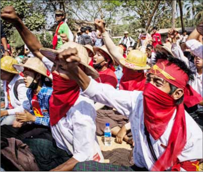
Activists wear bandanas with the ABFSU logo during a protest at Letpadan on March 10, shortly before a police crackdown.

The four activists detained in Yangon were taken to Tharyarwady Prison and charged with involvement in