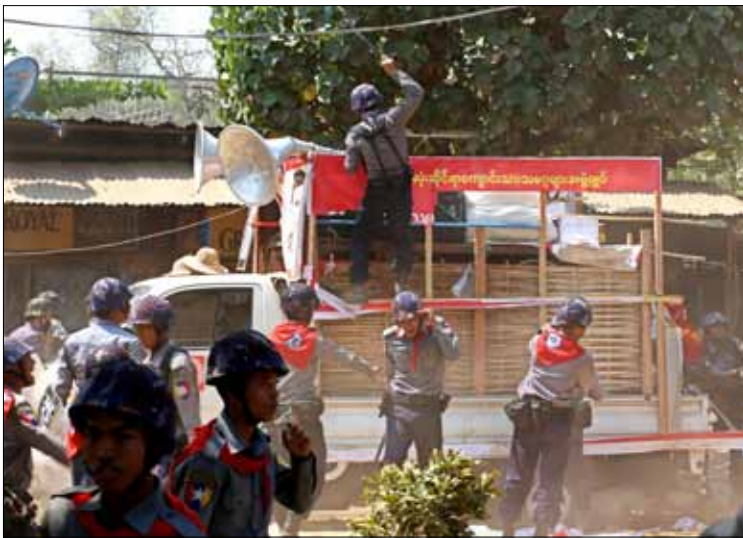
Left: A student protester cries following the confrontation between police and demonstrators. Top: An injured female student is carried by colleagues. Above: Police attack a light truck used by the demonstrators.

fly their flags or shout slogans on the way to Yangon, leading to the police assault at about 1:30pm.