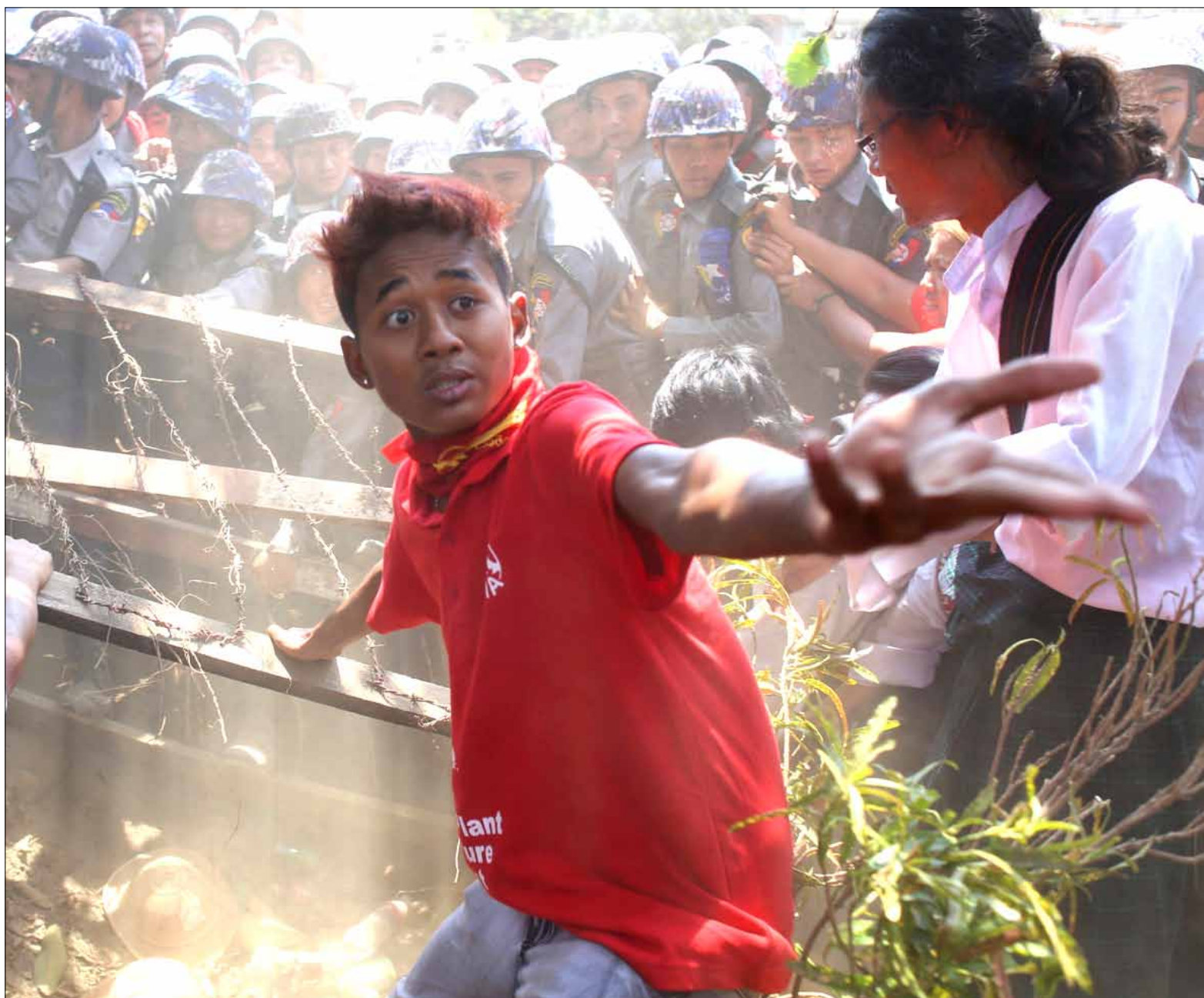
Student demonstrators cling to a barricade during a confrontation with police at Letpadan in Bago Region yesterday.